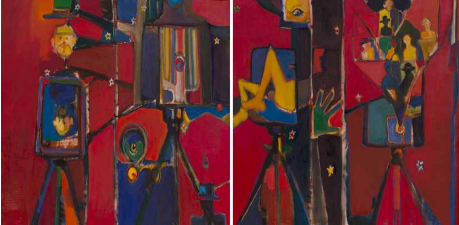
The Dialogue Between Mathew Brady and His Body 2005, oil on canvas, 2 panels, 50 x 100" overall