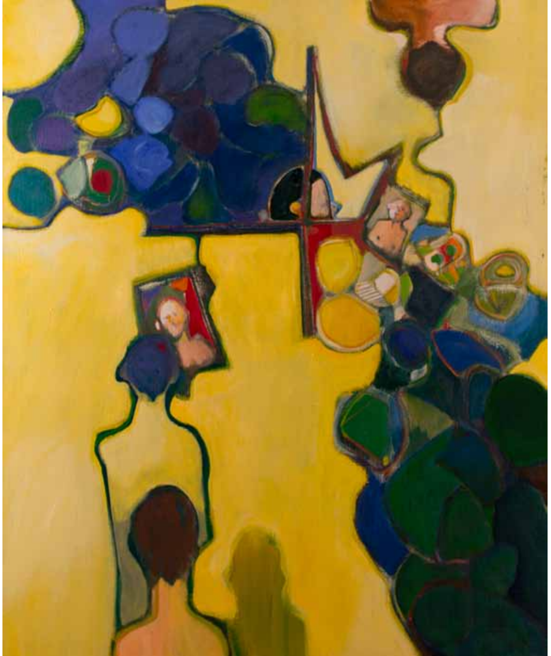
Asian Love Saiho-Ji 2004, oil on canvas, 60 x 50"