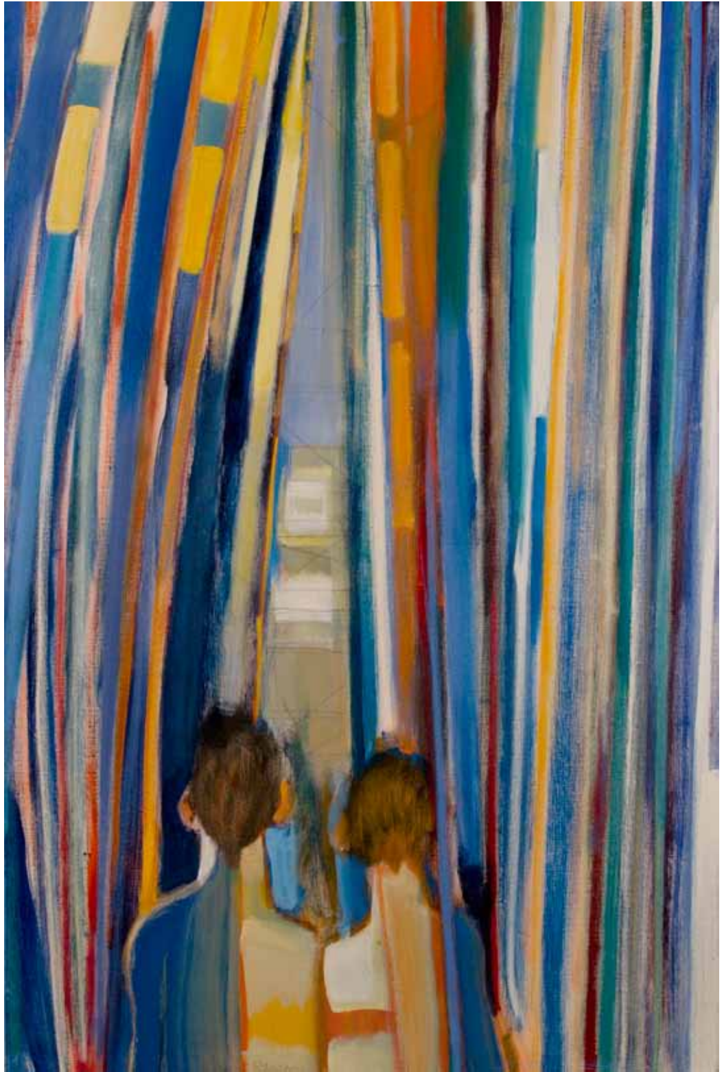
Raining In Chichen-Itza 2004, oil on canvas, 60 x 40"