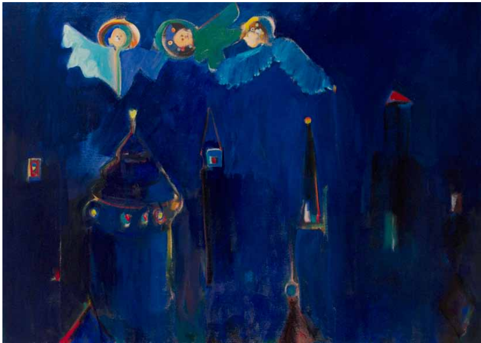
Pinturicchio: Urban Angels 2008, oil on canvas, 50 x 70"