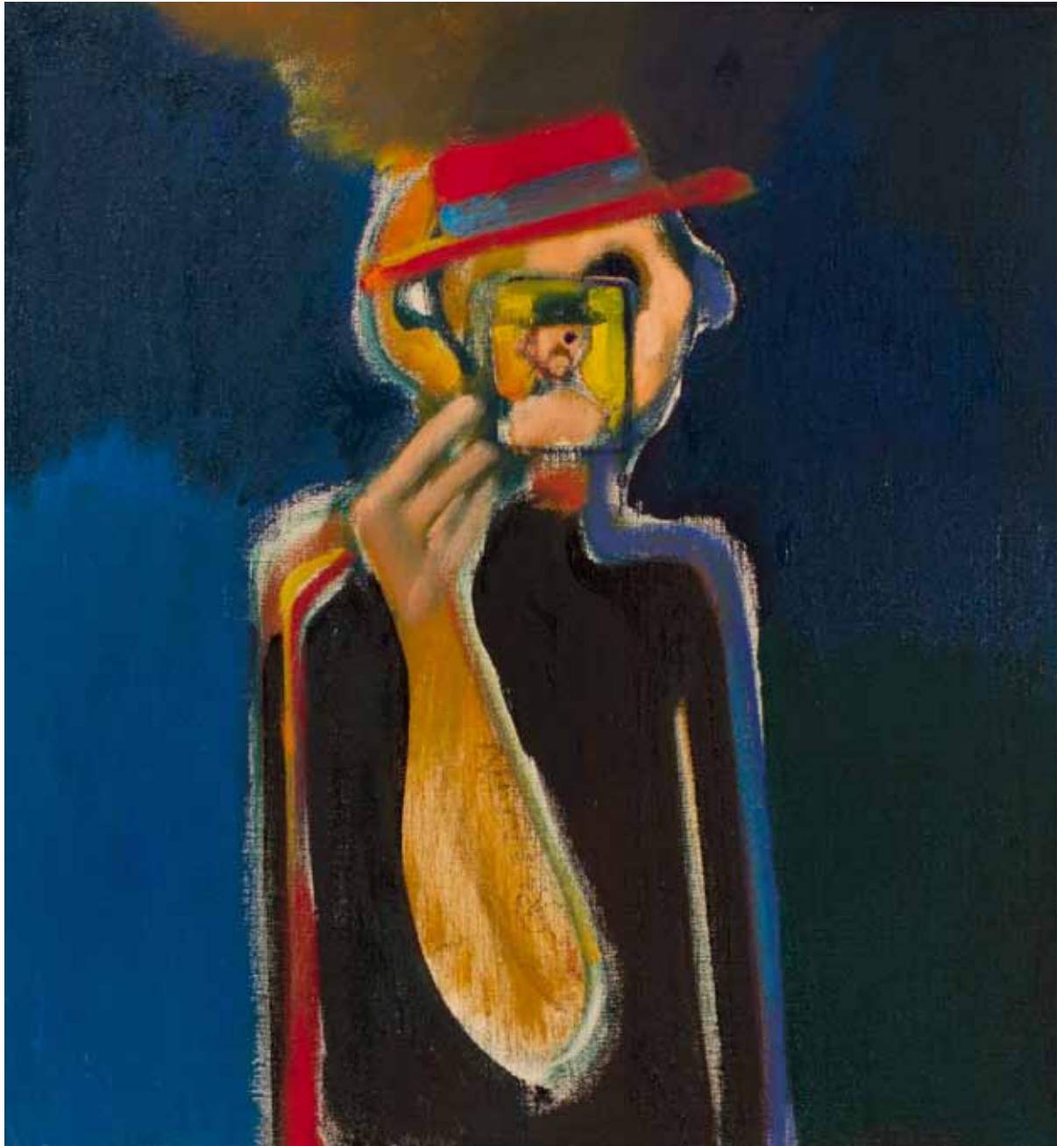
Photographing You 2006, oil on canvas, 28 x 26"