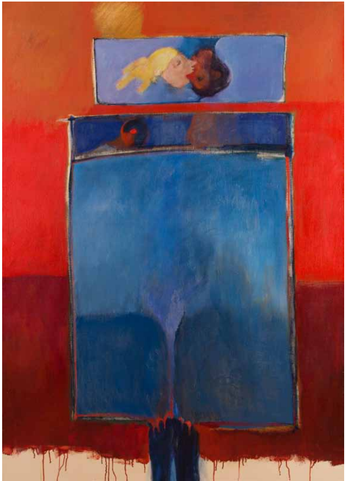
My Conception: Coming Into the Picture 2001, oil on canvas, 70 x 50"