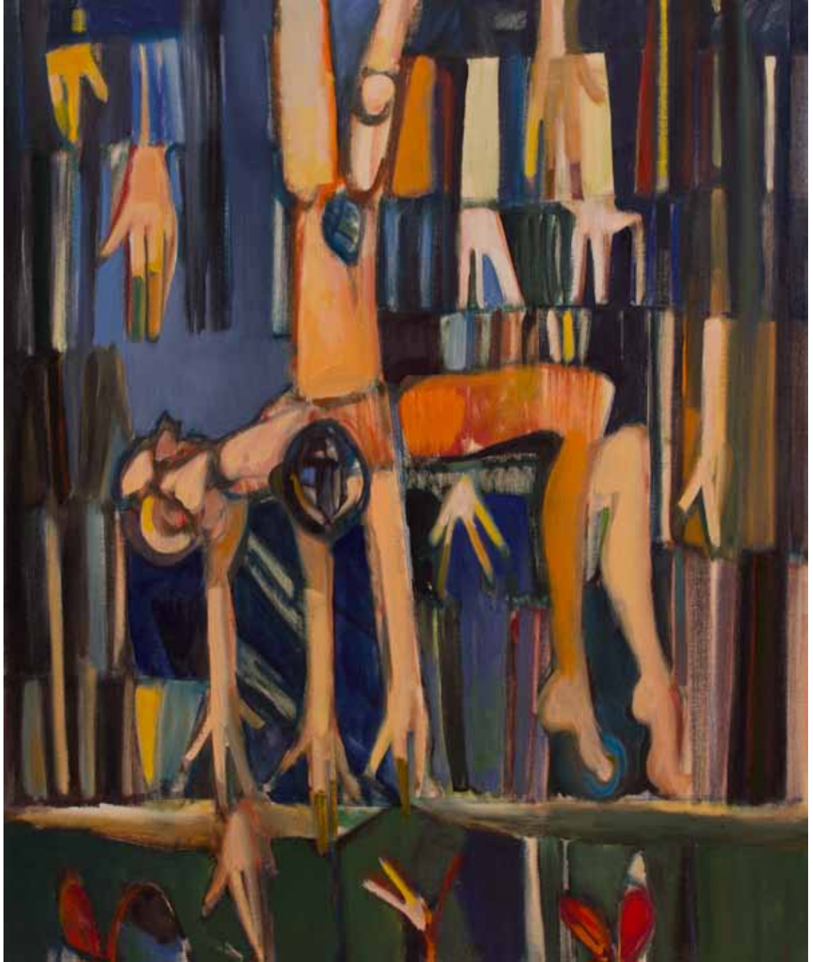
Night Touching Bottom, 2009, oil on canvas, 60 x 50"