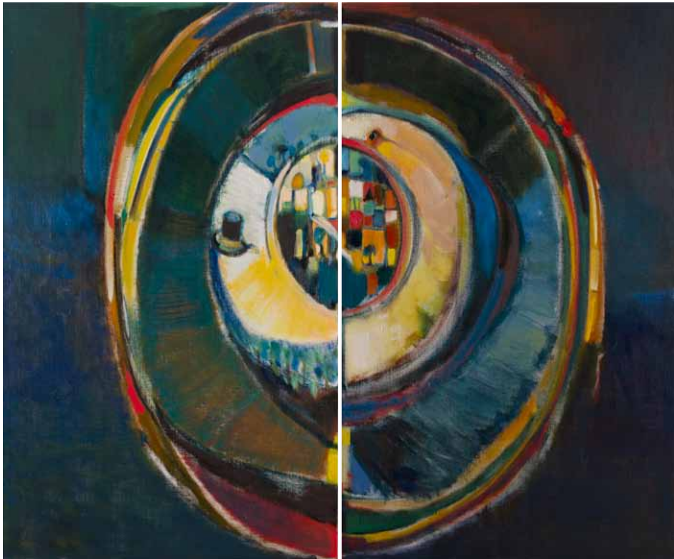
Millard Fillmore: Broken Efforts at Making Circle 2012, oil on canvas, 2 panels, 50 x 60" overall